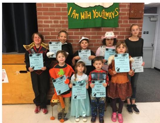
CONGRATULATIONS TO OUR OCTOBER STUDENT MERIT AWARD WINNERS!

Intertrain will be coming to our school THIS THURSDAY for Bus Safety Presentations. The K-3 student presentation will feature 'Buster The Bus' beginning at 1:30 p.m. and the 4-8 student presentation will feature a 'Game Show Format' beginning at 2:15 p.m.